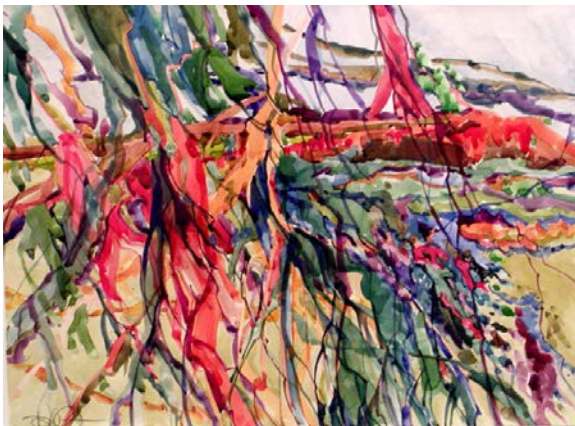
$100 Saint Louis Watercolor Society Award for Achievement Dottie Miles Landscape 2